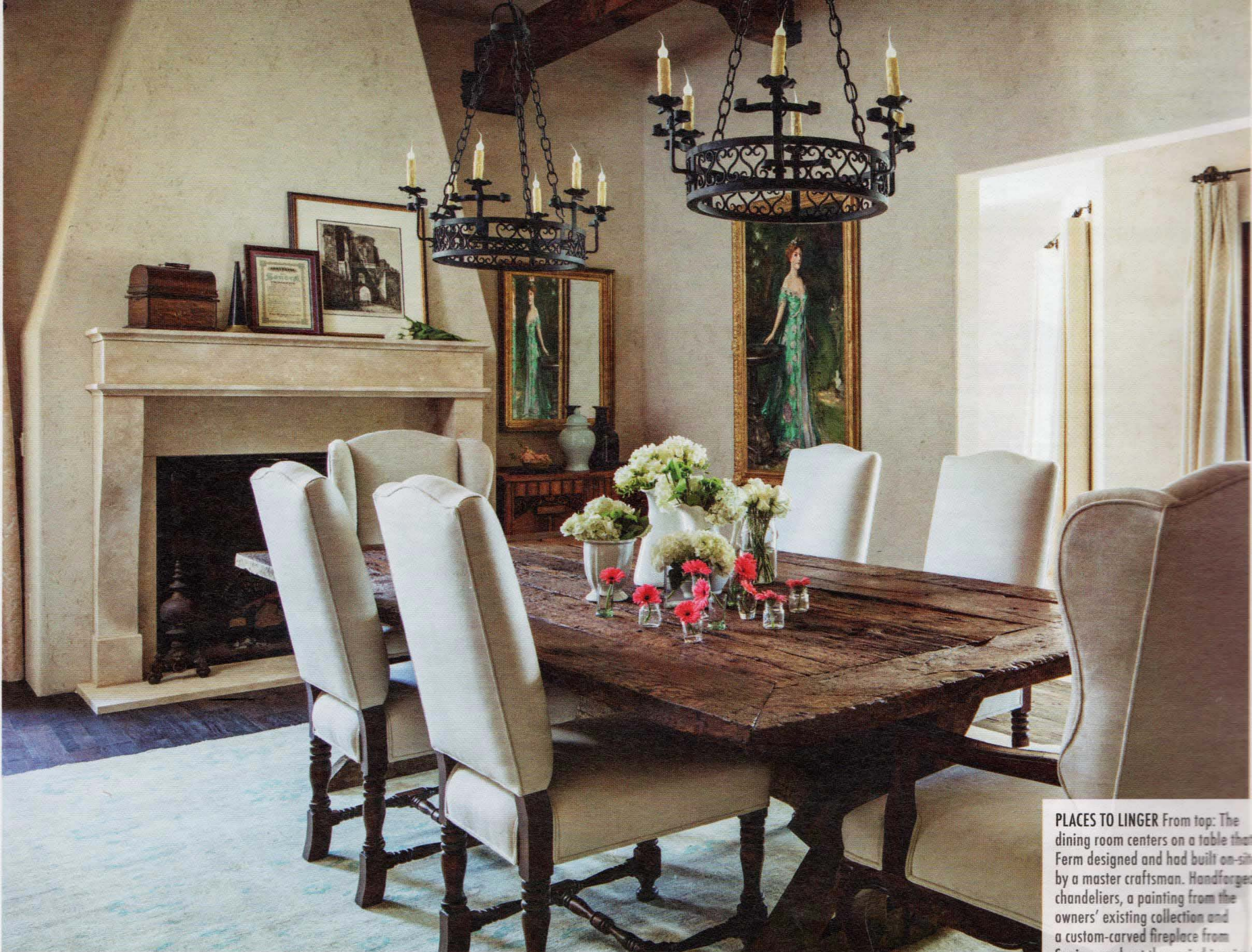
PLACES TO LINGER From top: The dining room centers on a table that Ferm designed and had built on-site by a master craftsman. Handforged chandeliers, a painting from the owners' existing collection and a custom-carved fireplace from Spain round out the period-inspired features; in the wine cellar, which accommodates some 4,000 bottles, Fremarc chairs surround another custom table designed and built on-site. The homeowners are oenophiles and have planted a small hobby vineyard on the property.

at the courtyard entrance with its carved Moroccan doors. The home was truly designed with entertaining in mind and offers plenty of outdoor space that allows guests (and the dogs and the grandkids) to move easily outside. All of the main living areas, as well as the kitchen and master bedroom, have views of the pool area, which connects the home to a 1,500-square-foot casita. There's also plenty of roaming space for the couple's four dogs, one horse and 12 chickens—a sight that only heightens the estate's country charm. It's worth noting that the owners went to considerable effort to make this a home that's sensitive to its environment: There are solar panels and water collection systems at work.